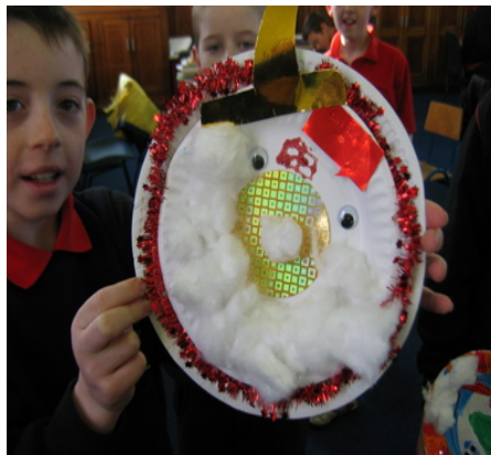
Colin Byrne's paper plate decoration.