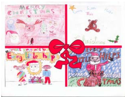
Dylan Murphy's Picture-bottom right.

The school received a special award from the New Ross Tidy Towns Committee in recognition of the work done by the school's pupils during our annual litter clean up. Each class targets an area of the town and last summer we collected over 20 plastic sacks of litter around the town. The litter was