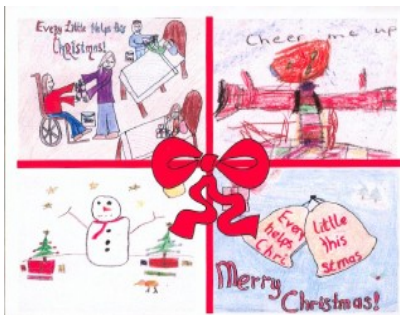
Gavin O'Leary's picture-bottom left.